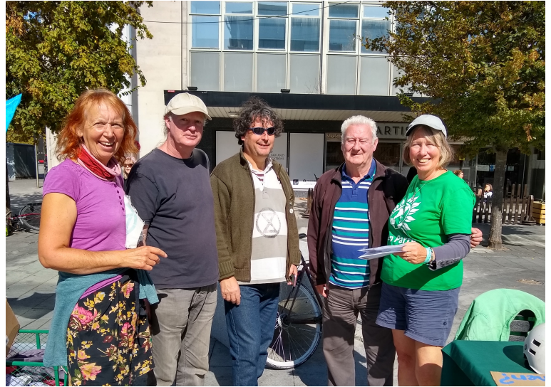
STRIKING FOR THE CLIMATE - Green Party members joined Southampton residents at the strike in Guildhall Square

Southampton Green Party are dedicated to ensuring our City Council hold up their commitment to the climate emergency they have already declared.